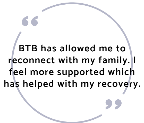
BTB Member attending Couples Peer Support Program

Recognizes a community partner dedicated to helping the Police Service or their family members attain the help they need.