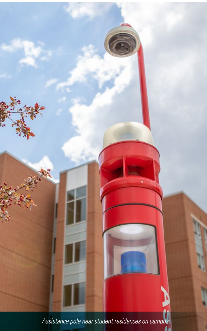
Assistance pole near student residences on campus.

As part of maintaining McMaster's emergency systems to ensure they are operating at the highest standard, the systems are fully activated at least twice annually. In addition to these regular tests, all McMaster Security Services staff are trained on the use of all these systems and partake in weekly testing to ensure complete knowledge of its use.